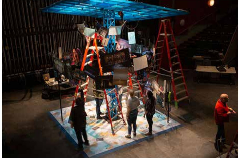
The UB team working on the exhibits for the Prague Quadrennial

"Our undergraduates are doing work that has histori-