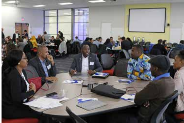
Enrichment Seminar participants introduce themselves