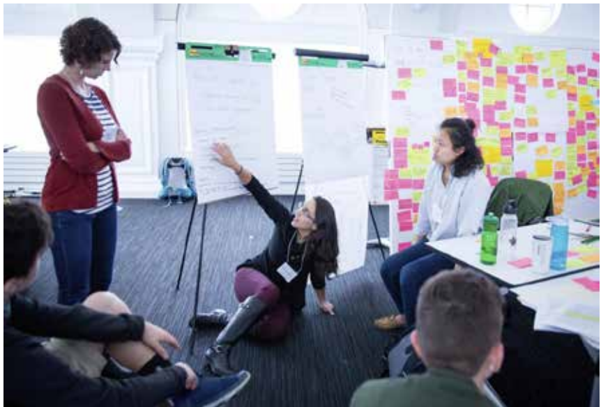
Participants in the Global Innovation Challenge

Finally, the Community of Excellence in Global Health