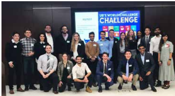
The seven teams at the UB finals competition in April 2019

Each three-person team was expected to be diverse in terms of discipline, gender and cultural background. Such diversity would add to the quality of the thinking behind each team's