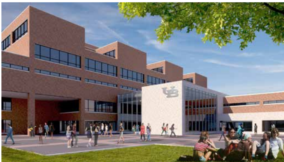
Rendering of One World Cafe from the Founders Plaza side