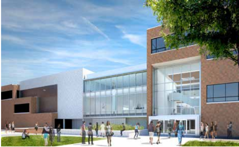
Rendering of One World Café from the north side

visitors enjoyed samples of two potential menu items for One World Café: a Mediterranean entrée, Chicken with preserved Lemons & Couscous, and an Indian entrée, Dal Tadka & Basmati Rice.