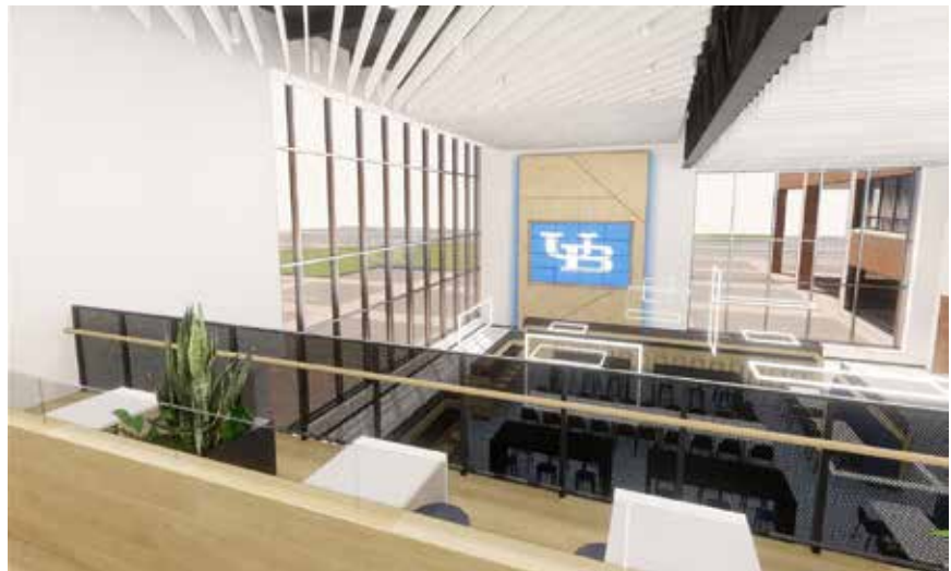
Rendering of the café interior from the second level tiered seating

“This will do a lot to improve wayfinding around the